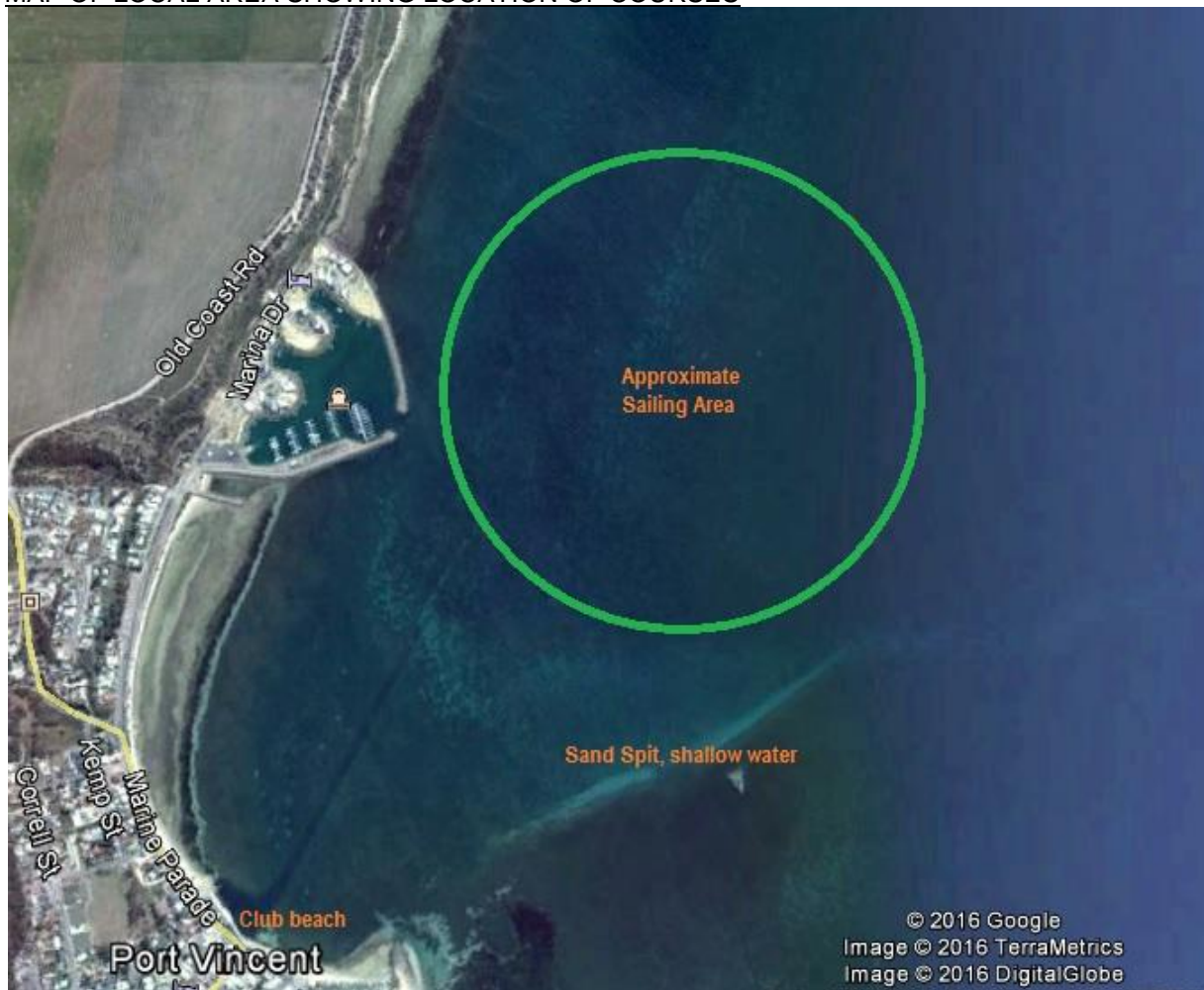
MAP OF LOCAL AREA SHOWING LOCATION OF COURSES